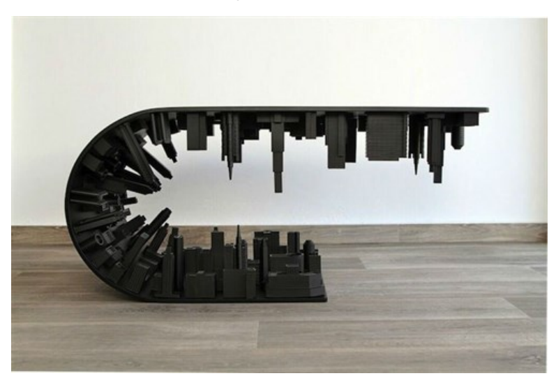
Stelios Mousarris, The Wave City

Stelios Mousarris, a Cypriot conceptual designer, presents The Wave City table which has transformed the intricate details of the cityscape into functional design using 3D printing technology. Dubai is flipped upside-down and the precision of each building is shown in stark contrast to the sleek, smooth shape of the tabletop.