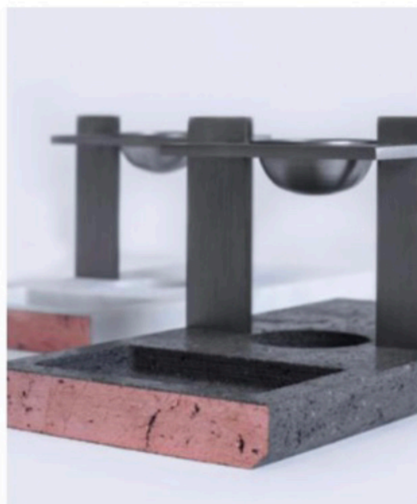
Tarek Elkassouf Flame, Contained Produced in Lebanon Carrara marble, basal, copper leafing 2020

Flame, Contained offers a series of ashtrays, candle holders, a censor burner and a ritual tray – all of which embody the idea of life as fire, offering objects that contain the flame while giving it new life and vitality. Tarek Elkassouf invites us to question our relationship with the powerful force of nature that burns both externally and internally. The collection is also an echo of the fires that raged across the Australian landscape earlier this year, where the designer was based. In Flame, Contained, fire meets ice in a paradox of materials that are designed to fuse and blend from one collectible work to the next, where lava stone, born from volcanic heat and pressure, is soothed by the cooling touch of Carrara marble.